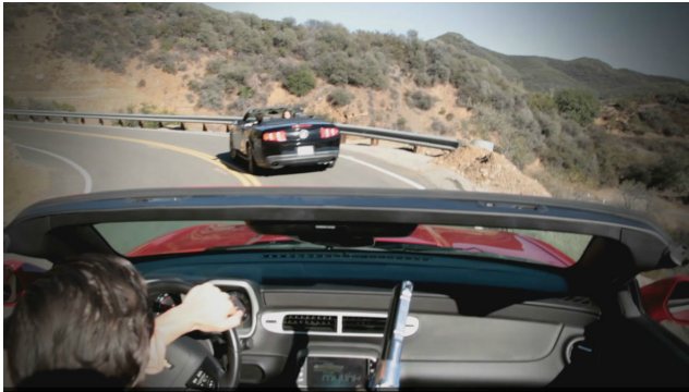
Car Chase shot in Latigo Canyon, Malibu

screen grabs of the live action and drew them as animation. Getting the timing right for these shots was rough!"